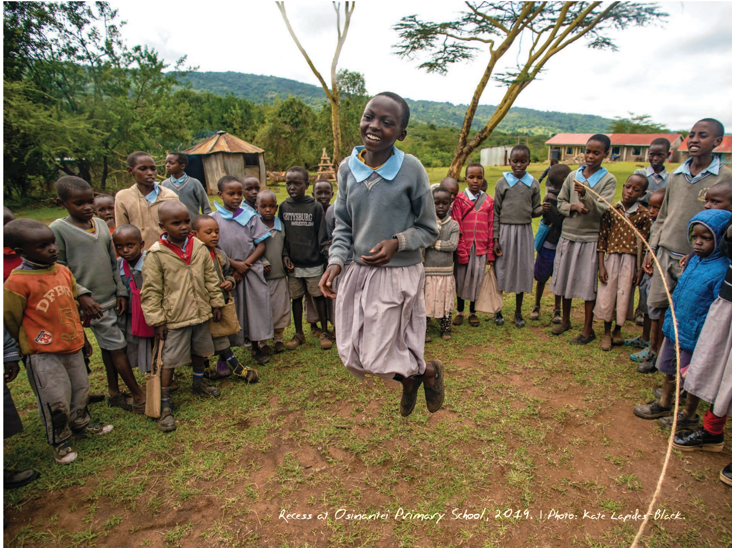
Recess at Osinantei Primary School, 2019. | Photo: Kate Lapidus-Black.