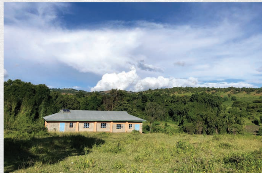
Above: Classrooms at Olorte Primary School.

As of this writing, Mause, the most remote of the communities we work with, has already built three new classrooms. The other three communities are concluding their fundraising and should start building within the next few months. Meanwhile, in the absence of classrooms, children have been learning in extra primary school classrooms or churches. Mause and Olorte have sophomore classes, Olmesutie has a junior class, and our first secondary school, Morijo, now has a senior class.